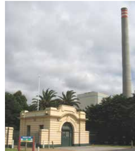
Gatehouse of former Newport Power Station

The proposal for a new gas-fired power station created an environmental controversy in the 1970s, and eventually the planned size of the power station was halved. The plant has a licence to discharge cooling water which may contain pollutants including chlorine, ammonia and iron into the sea. Good catches lure amateur fishers to the warm water outlet from the power station, called ‘The Warmies’.