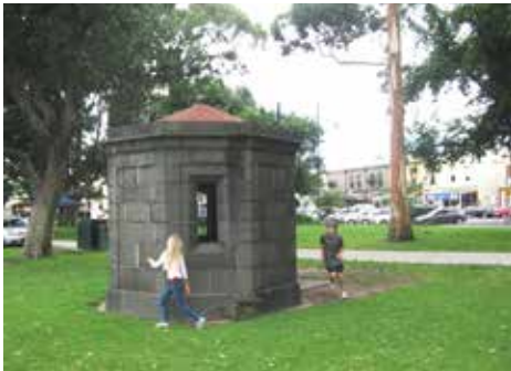
Tide gauge housing

Some historic relics are displayed along the foreshore – guns and anchors from the colony of Victoria’s first battleship HMVS Nelson (see page 85), and the housing of the tide gauge which was once located on Breakwater Pier. The elegant former Customs House, on the corner of Syme Street was built in 1872–73 and is on the Victorian Heritage Register.