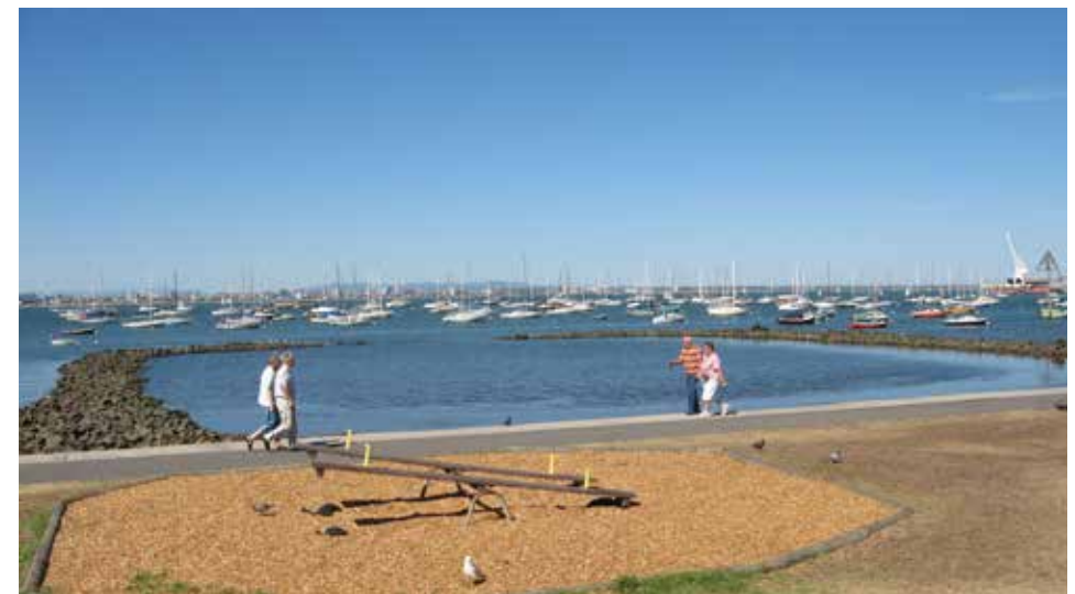
Former swimming pool, Williamstown