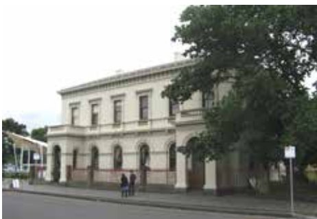
Former Customs House

Opposite Clark Street there are remnants of a swimming pool from the 1930s in the form of basalt boulder embankments.